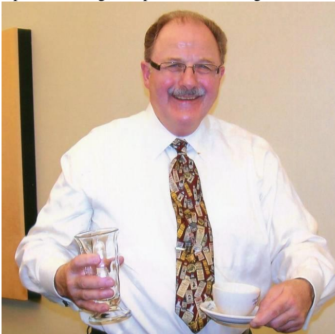
July Picnic Pot Luck scene