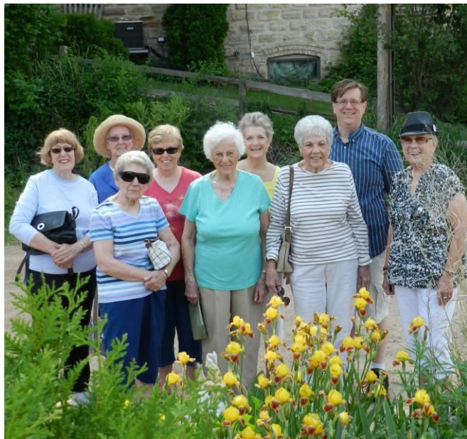
The Jordan excursion

A clothesline was a news forecast, To neighbors passing by, There were no secrets you could keep, When clothes were hung to dry. It also was a friendly link, For neighbors always knew If company had stopped by, To spend a night or two. For then you'd see the "fancy sheets", And towels upon the line; You'd see the "company table cloths", With intricate designs. The line announced a baby's birth, From folks who lived inside, As brand new infant clothes were hung, So carefully with pride! The ages of the children could, So readily be known By watching how the sizes changed, You'd know how much they'd grown! It also told when illness struck, As extra sheets were hung; Then nightclothes, and a bathrobe too, Haphazardly were strung. It also said, "On vacation now", When lines hung limp and bare. It told, "We're back!" when lines sagged, With not an inch to spare! New folks in town were scorned upon, If wash was dingy and gray,