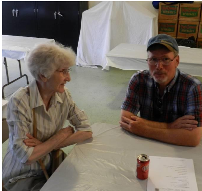
More of the July Picnic Pot luck

A clothesline was a news forecast, To neighbors passing by, There were no secrets you could keep, When clothes were hung to dry. It also was a friendly link, For neighbors always knew If company had stopped by, To spend a night or two. For then you'd see the "fancy sheets", And towels upon the line; You'd see the "company table cloths", With intricate designs. The line announced a baby's birth, From folks who lived inside, As brand new infant clothes were hung, So carefully with pride! The ages of the children could, So readily be known By watching how the sizes changed, You'd know how much they'd grown! It also told when illness struck, As extra sheets were hung; Then nightclothes, and a bathrobe too, Haphazardly were strung. It also said, "On vacation now", When lines hung limp and bare. It told, "We're back!" when lines sagged, With not an inch to spare! New folks in town were scorned upon, If wash was dingy and gray,