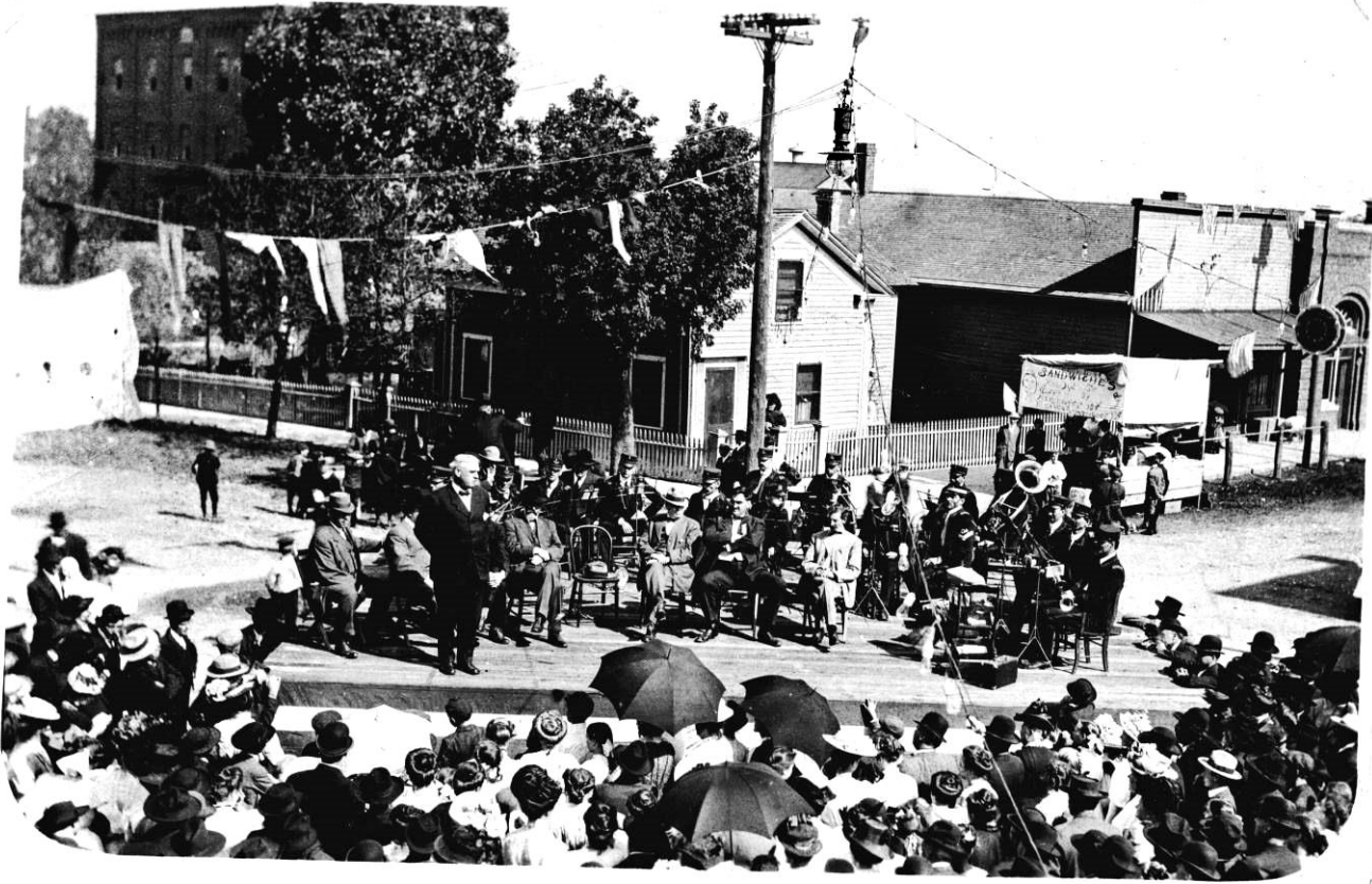
First Ave looking East from Lewis Street Donation Betty Dolls

I any of you have a picture, an issue, a message for members, an idea for an article, or something of interest to our members, let any member of the board know and we will try to get it in the next newsletter.