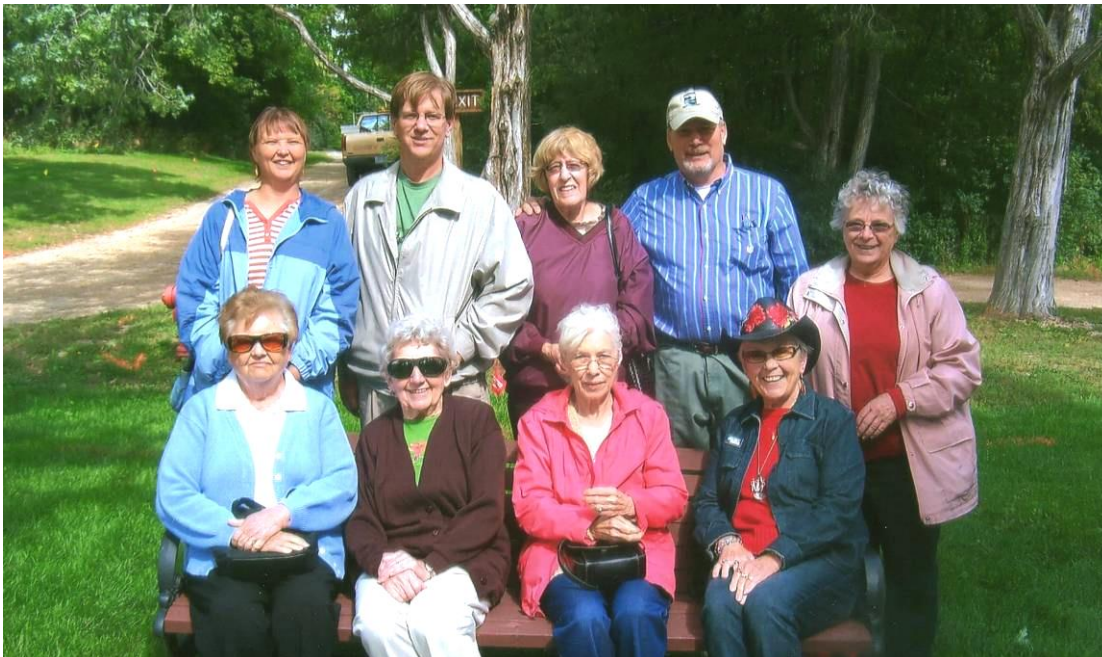
The SHS trip to the Gideon and Agnes Pond House and farm which sits on the Minnesota River bluffs in Bloomington MN. I hear it was a great trip and wonderful time for those who made it.