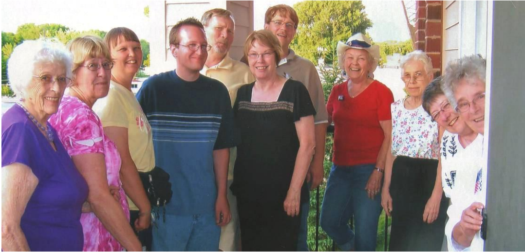
On the Balcony for a picture at the Pot luck dinner in July. Held in the Northridge Court Community room it was another fun event.