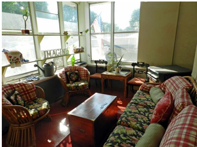
Pictures by Melissa Whiting, Read Field trip on page 2 from Lois Wendt's Notes.