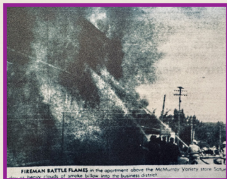
FIREMAN BATTLE FLAMES in the apartment above the McMurray Variety store. Some firefighters are visible at a street corner, and the business district.